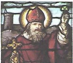
Painting of St. Patrick

ST. PATRICK’S DAY - St Patrick’s Day is celebrated annually on March 17th, the traditional religious feast day of St. Patrick and the day he is believed to have died in 460 A.D.